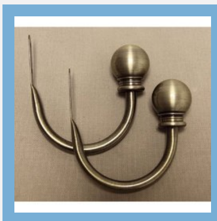
Curtain Hold Backs