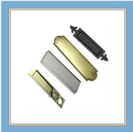
Door Letter & Finger Plate