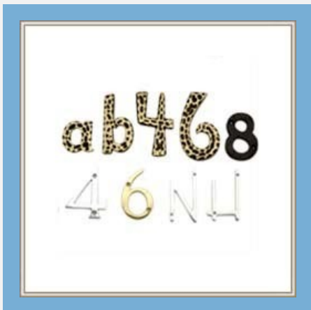
Numeral & Alphabet