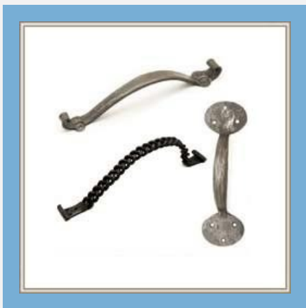
Hand Forged Pull Handle