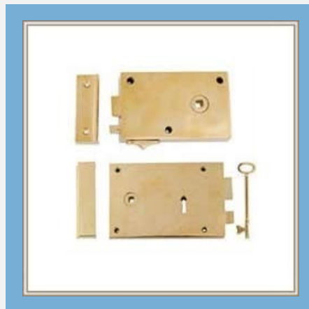
Rim Lock & Latches