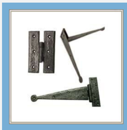
Hand Forged Hinge