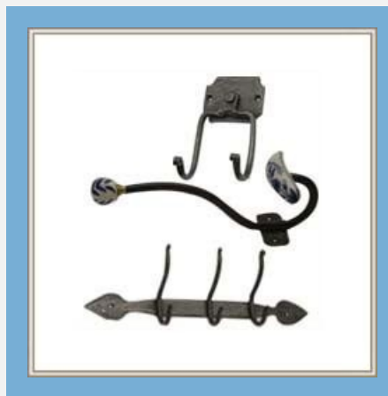
Hand Forged Hook