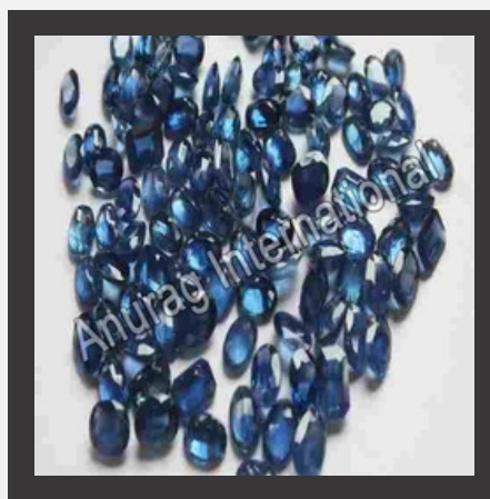
Oval And Octagon Blue Sapphire