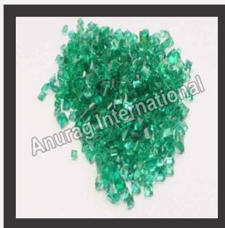
Square Emerald Gemstones