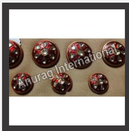
Kundan Sherwani Buttons