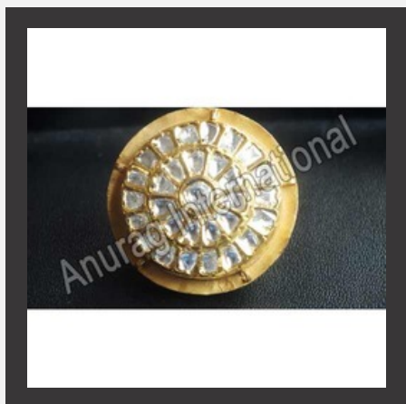
Polki Maang Tikka Borla

Manufacturer & Exporter of a wide range of products which include Borla Maang Tikka such as Polki Maang Tikka Borla, Emerald Polki Maang Tikka Borla, Meenakari Maang Tikka Borla, Pearls & Ruby Maang Tikka Borla and Ruby Polki Maang Tikka Borla.