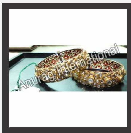
Kundan Meenakari Bangles