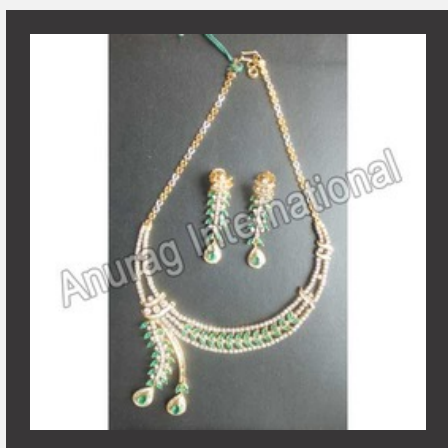
Diamond & Emerald Necklace Set