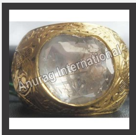
Gold Finger Rings