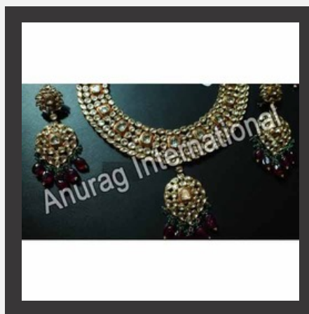
Kundan Necklace Sets