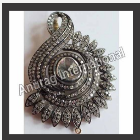
VJ5 Victorian Jewellery