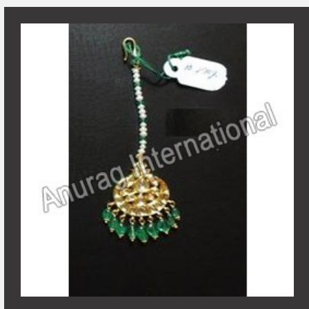
Emerald Maang Tikka