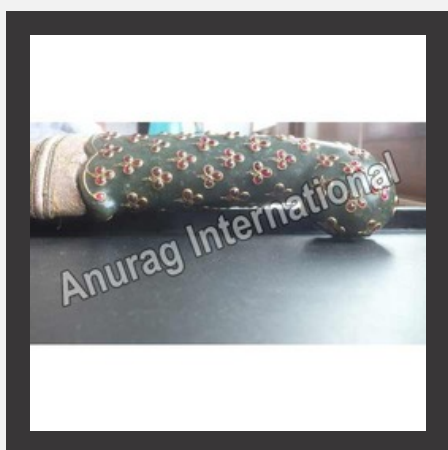
Ruby Gemstone Studded Kataar

King's choice : For the one who wishes to experience and carry forward their royalty.