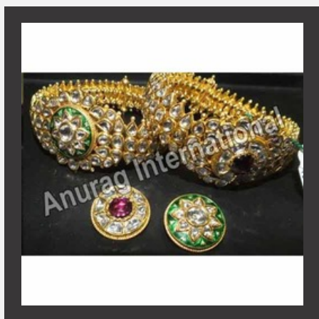
Kundan Bangles (Kade)