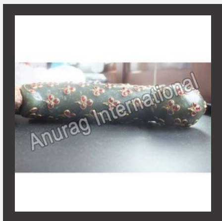
Ruby Stone Studded Kataar