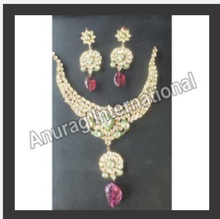
Kundan Ruby Necklace Sets

Offering you a complete choice of products which include Kundan Jewelry such as Kundan Ruby Necklace Sets, Kundan Bracelets, Bridal Jewelry Sets, Kundan Meena Polki- Ring, Ring Kundanmeena Polki-1A, Ring Kundan Meena Polki and many more items.