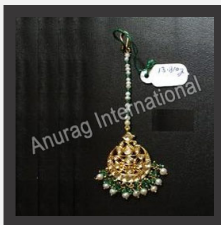
Emerald Maang Tikka