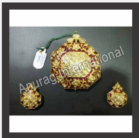
Meenakari Pendant Set

Manufacturer & Exporter of a wide range of products which include Pendant Sets such as Meenakari Pendant Set, Ruby & Kundan Pendant Set, Kundan & Ruby Pendant Set, Kundan Pendant Set, Hexagon Kundan Meena Pendant and Kundan Meena Pendant - Diamond Polki.