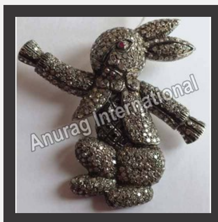
VJ6 Victorian Jewellery