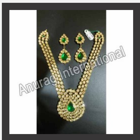
Emerald & Kundan Necklace Sets