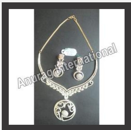
Diamond Necklace Set

We are a leading Manufacturer & Exporter of Diamond Jewelry such as Diamond Necklace Set, Diamond Pendants, Diamond & Emerald Necklace Set, Diamond & Sapphire Necklace Set and Diamond & Ruby Necklace Set from India.