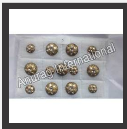
Kundan Sherwani Buttons