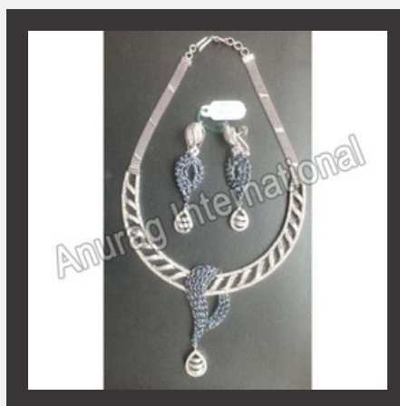
Diamond & Sapphire Necklace Set