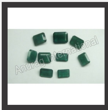
Cut & Polished Emeralds