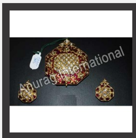
Meenakari Pendant Set