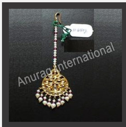
Pearls Maang Tikka