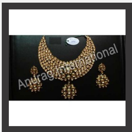
Kundan Necklace Sets

Leading Manufacturer and Exporter of Kundan Jewelry Sets such as Kundan Necklace Sets, Ruby & Kundan Necklace Sets, Emerald & Kundan Necklace Sets and Kundan Meena Necklace Diamond Polki from Jaipur.