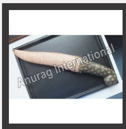
Ruby Studded Kataar