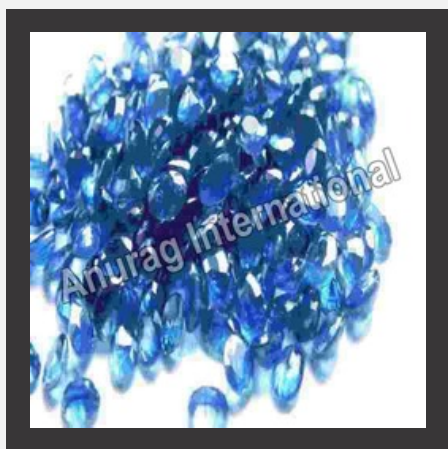
Oval Blue Sapphire

We offer a wide range and variety of Blue Sapphire Gemstones.