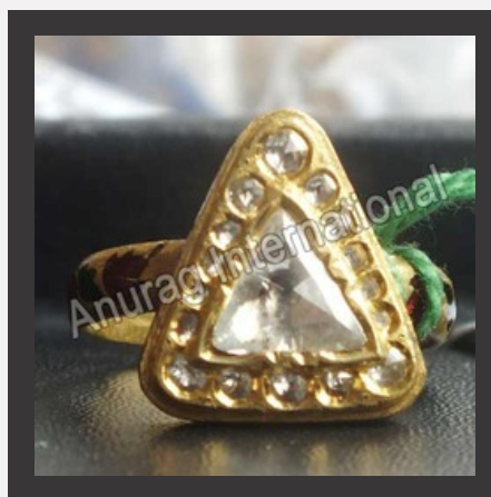
Meenakari Gold Rings