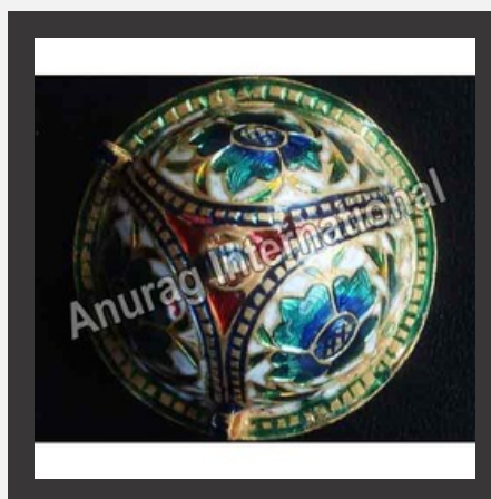
Meenakari Maang Tikka Borla