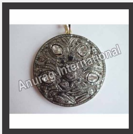
VJ3 Victorian Jewellery