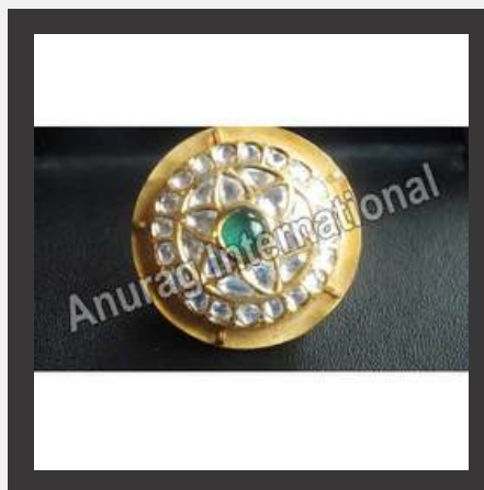
Emerald Polki Maang Tikka Borla