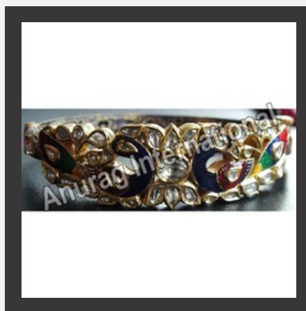
Peacock Kada -1A