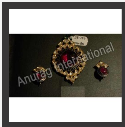
Ruby & Kundan Pendant Set