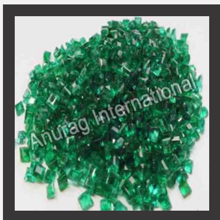
Square Emerald Gemstones

We proudly offer you the widest range of Emerald Gemstones. These gemstones have excellent cut & clarity. Emeralds are offered on the basis of carat & clarity demanded by our esteemed clientele.