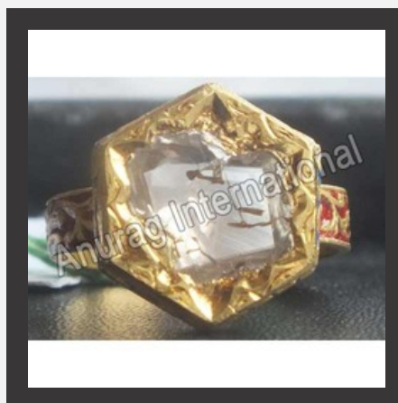
Meenakari Gold Rings