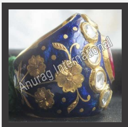
Gold Polki Finger Rings

Our product range includes a wide range of Meenakari Finger Rings such as Gold Polki Finger Rings, Meenakari Gold Rings and Gold Finger Rings.