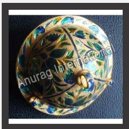
Meenakari Maang Tikka Borla