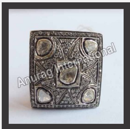
VJ 1 Victorian Jewellery

Manufacturer & Exporter of a wide range of products which include Victorian jewellery such as VJ 1 Victorian Jewellery, VJ3 Victorian Jewellery, VJ5 Victorian Jewellery, VJ6 Victorian Jewellery, VJ7 Victorian Jewellery, VJ17 Victorian Jewellery and many more items.