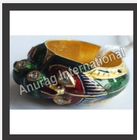
Kundan Meena Polki- Ring