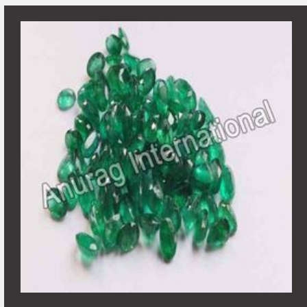
Oval Emerald Gemstones