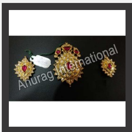
Kundan & Ruby Pendant Set