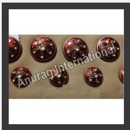
Kundan Sherwani Button Set

Creating a niche of Sherwani Buttons such as Kundan Sherwani Button Set, Kundan Sherwani Buttons and Kundan Studded Sherwani Buttons at its best, with utmost quality.