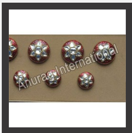
Kundan Studded Sherwani Buttons