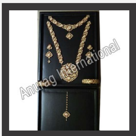
Bridal Jewelry Sets