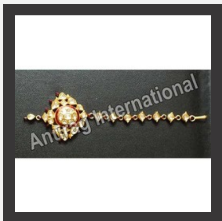
Polki Maang Tikka

Indian women have a tradition to apply kumkum as a symbol of longevity of their husbands and love towards them. The ornament that enhances the beauty of those values is Maang Tika - upholding traditions .