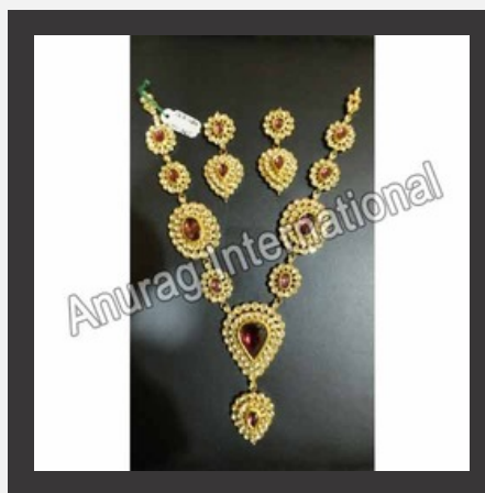
Ruby & Kundan Necklace Sets