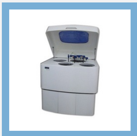
Fully Automatic Biochemistry Analyzer