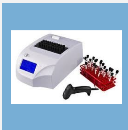
Erythrocyte Sedimentation Rate Analyzer