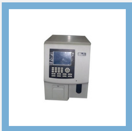
Vet Hematology Analyzer