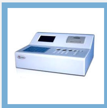
Fully Automatic Coagulometer