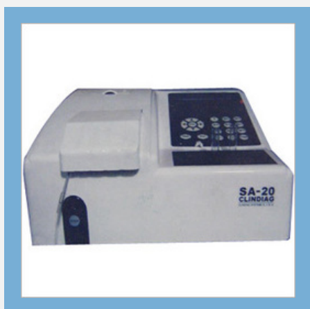
Semi-Automatic Clinical Chemistry Analyzer