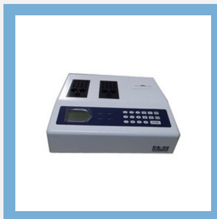
One Channel Coagulometer