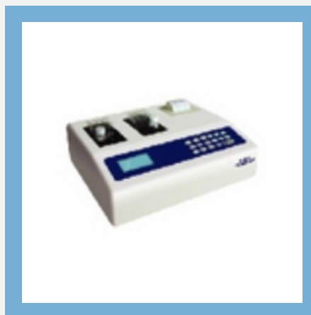
Double Channel Coagulometer