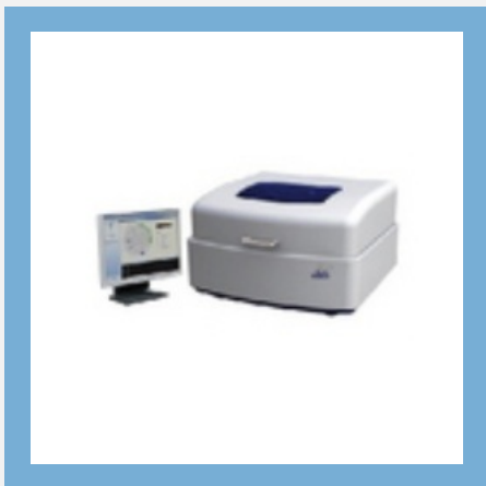
Automatic Biochemistry Programme