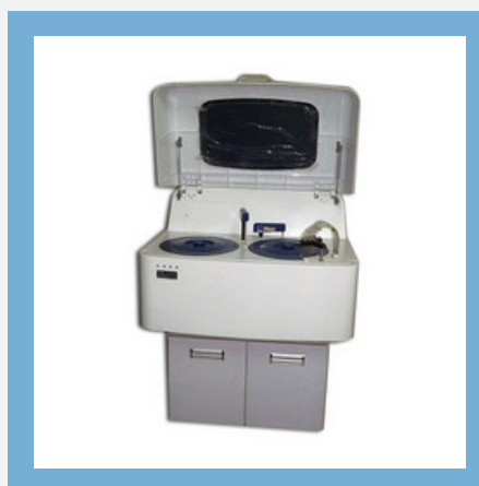
FA 200 Fully Automatic Biochemistry Analyzer