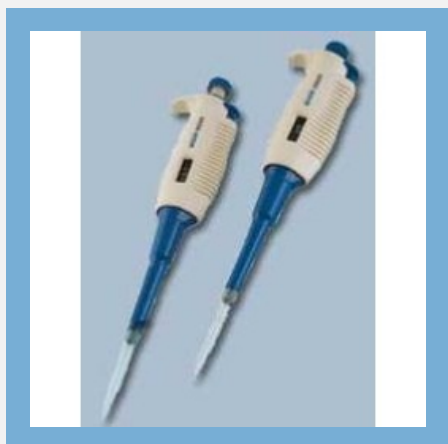
Variable Volume Micropipette