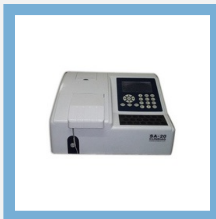
Chemistry Analyzer (SA- 10-20)