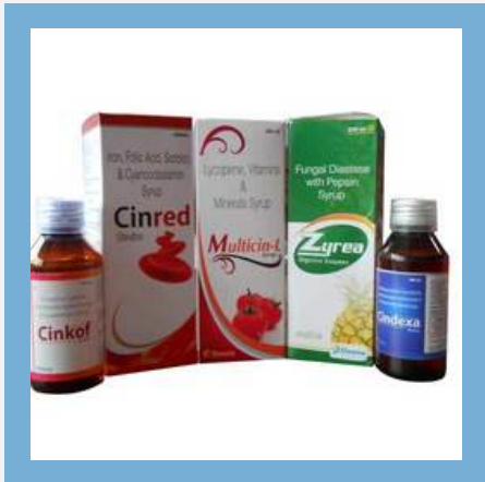
Cough Syrup Tonic