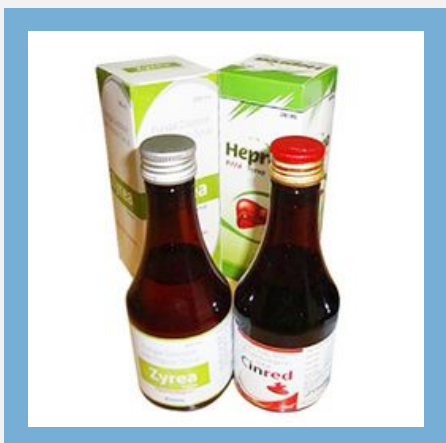
Ayurvedic & Herbal Medicines