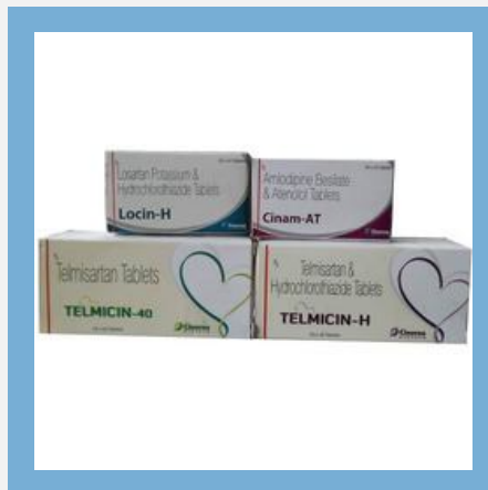
Anti Allergic Capsules