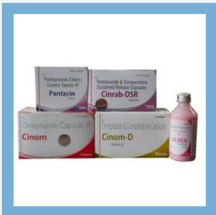
Pre & Pro Biotic Capsules