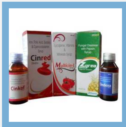
Digestive Enzymes Syrups