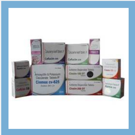
Nutritional Supplements Capsules