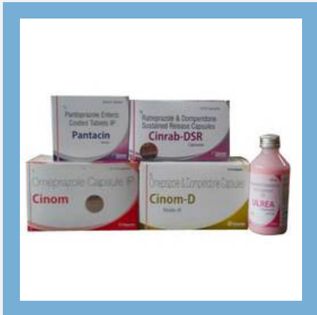
Antacid Capsules & Syrups