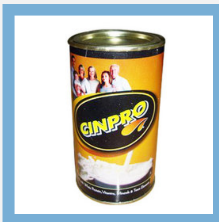
Nutritional Supplement Powder