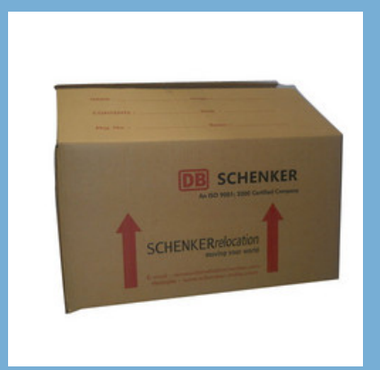
Motor Parts Cartons