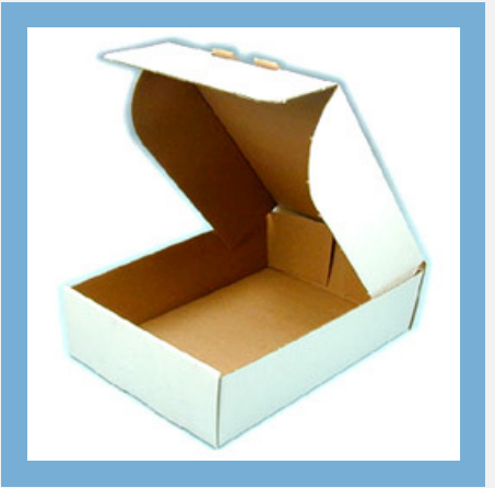
Laminated Corrugated Boxes