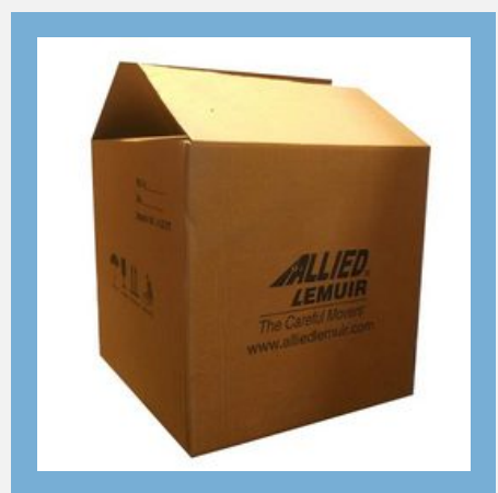
Accessories & Books Cartons