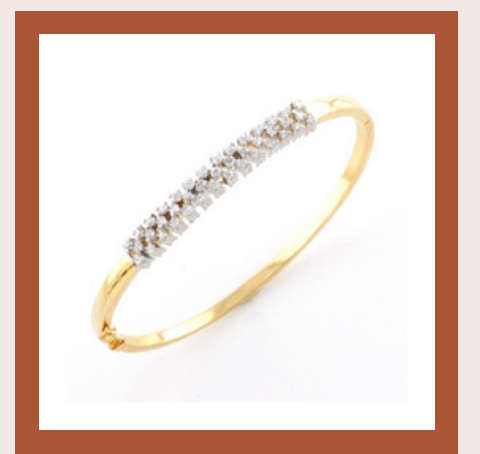
Designer Diamond Bracelet