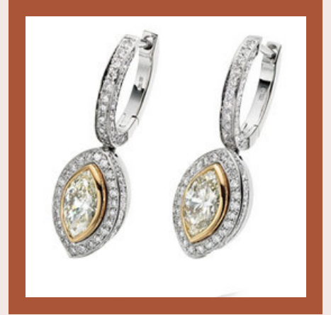
Designer Diamond Earring