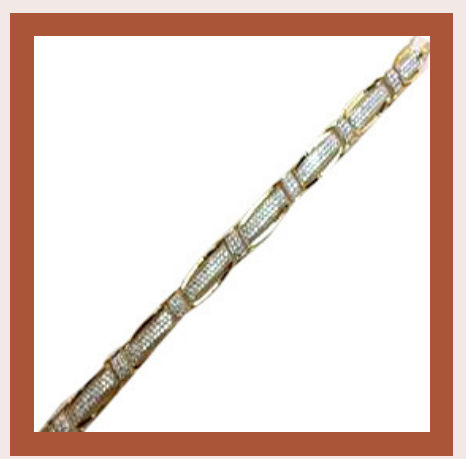
Diamond Studded Gents Bracelet