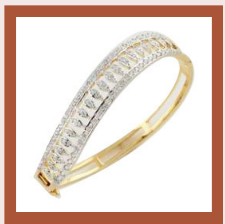
Fancy Diamond Bracelet