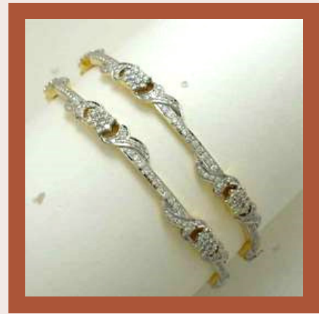
Fancy Diamond Bangles