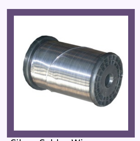
Silver Solder Wire