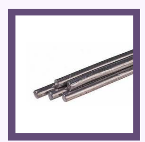
Lead Solder Sticks