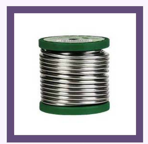
Lead Free Solders