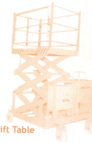
Hydraulic Scissor Lift Table SE-5 Cap-2.5 ton