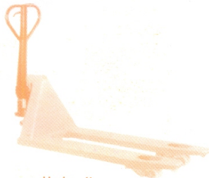
Hydraulic Hand Pallet Truck SE-1 Cap-1 to 5 ton