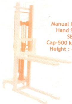
Manual Hydraulic Hand Stacker SE-6 Cap-500 kgs to 2 ton Height : 4200 mm