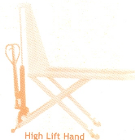
High Lift Hand Pallet Truck SE-2 Cap-250 Kgs to 1 ton