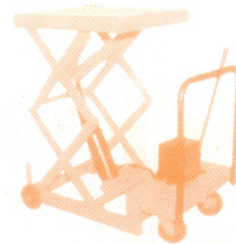
Hydraulic Manual Scissor Lift Table SE-3 Cap-500 to 3000 Kgs. Heigh : 2500 mm