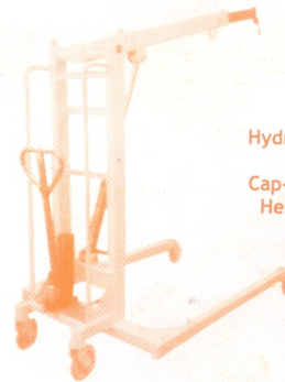
Hydraulic Floor Crane SE-7 Cap-500 kgs. to 3 ton Height : 3000 mm.

Your Satisfaction and Growing Faith in our products are our Achievement