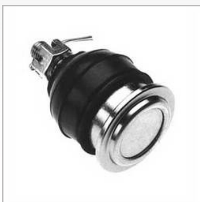
Ball Joint 01