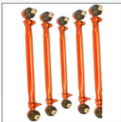
Tie Rod Assembly