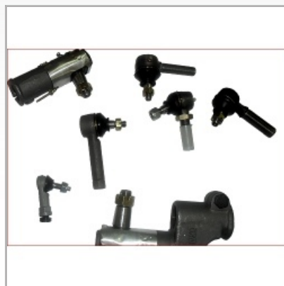
Tie Rod/Draglink Kit