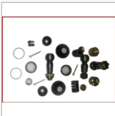
Tie Rod Repair Kit/Drag Link