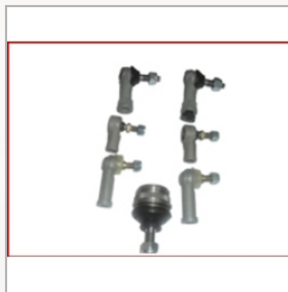
Gear Shift Ball Joint/End