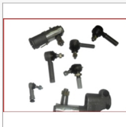
Tie Rod Ends